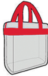
CLEAR PLASTIC BAG No larger than 12" x 12" x 6"